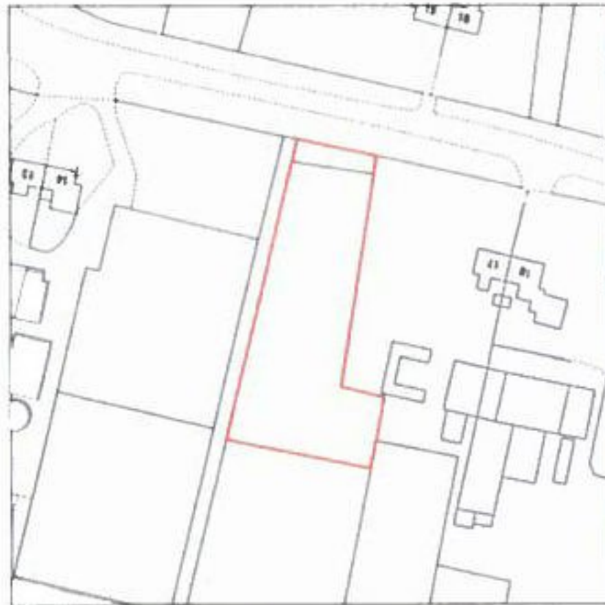
Land attached to 17 Coggeshall Road, Ardleigh